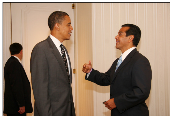
Presidential candidate Sen. Barack Obama with LA Mayor Antonio Villagairosa at LULAC Conference.

The best part is that it still only cost $25 annual membership fee to join. Go into our web site www.lulac.org and find out more. So if you want to be part of the largest Hispanic American and migrant organization in the country, all you have to do is sign up and pay your dues. You will then be put on our mailing list to keep up with all of the various issues, activities and events that we hold during the course of the year. Remember: Juntos! Si Se Puedes!