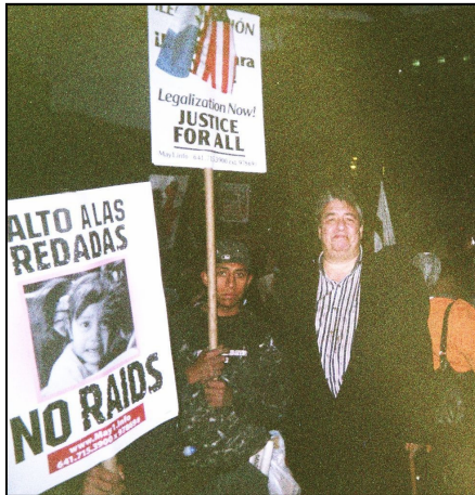
LULAC New York State Chapter protests against unjust Immigration Laws and calls on Congress to enact comprehensive Immigration reform legislation that secures borders

The final reports will be issued at next year's LULAC Convention to be held in Albany.