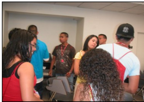
LULAC youths from all over the country including two from New York State participate in leadership training program in New Mexico